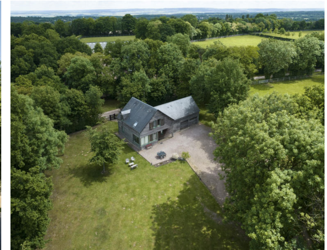
LES COTIS HOUSE