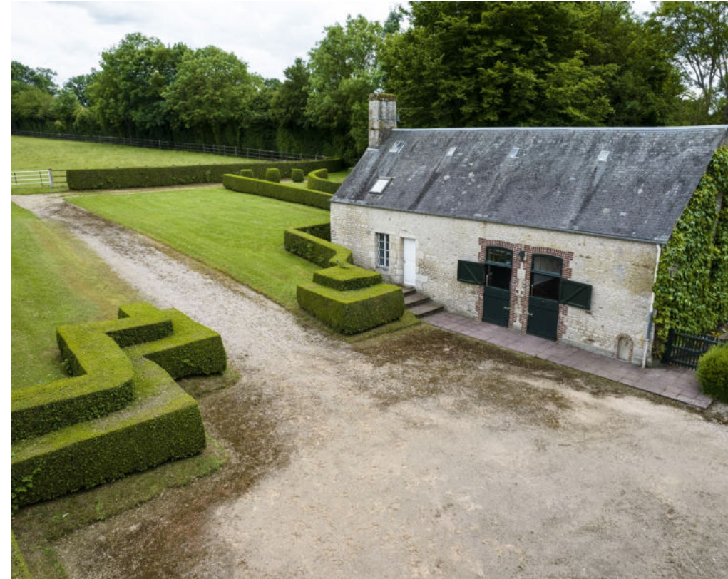
LAVOIR ETALON HOUSE