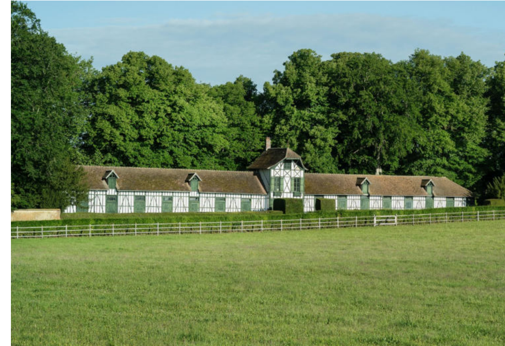
— Pavillon barn : 16 boxes to be renovated.