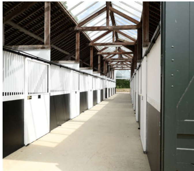
— Le Tronqueret barn : 36 boxes.