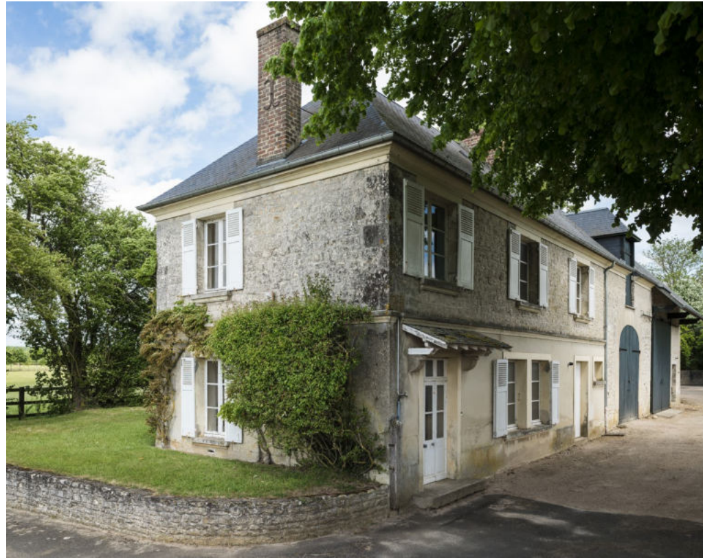
BELLE ETOILE STAFF HOUSE

The Haras de Fresnay le Buffard has 22 staff lodgings, including 16 houses, spread throughout the estate for a total living area of 1860 sqm.