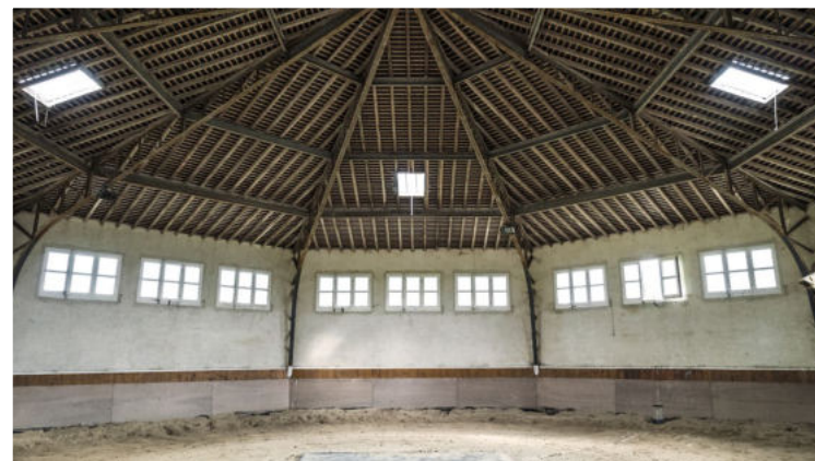
— Covering/breeding shed : 18 meters diameter.