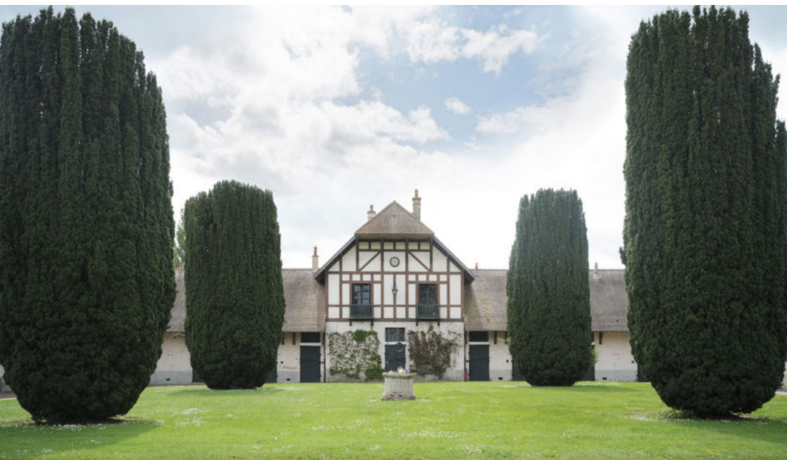
— Only One yard : 42 boxes.