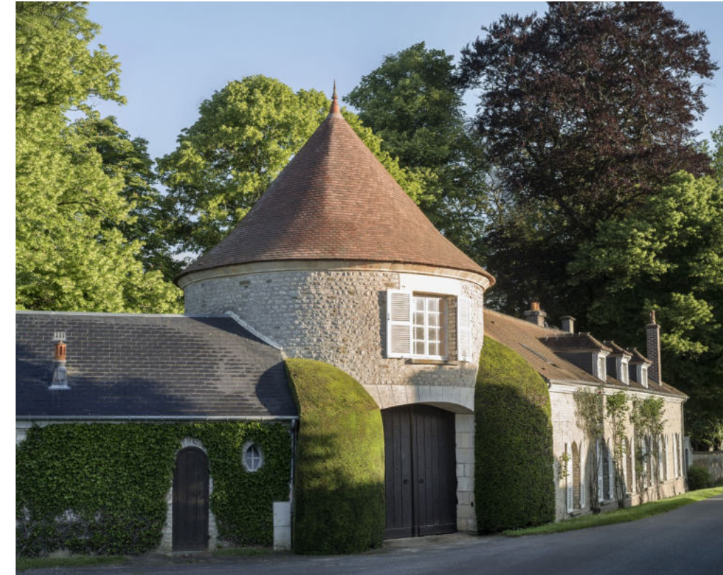
LA TOUR ACCOMMODATION