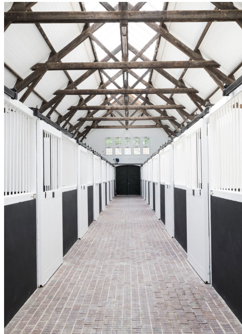
— La Piste barn : 32 boxes.