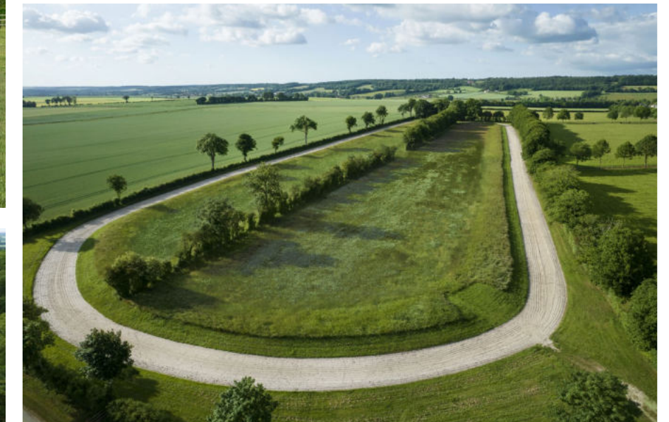
— Training track : 900 meters long x 8 meters wide.