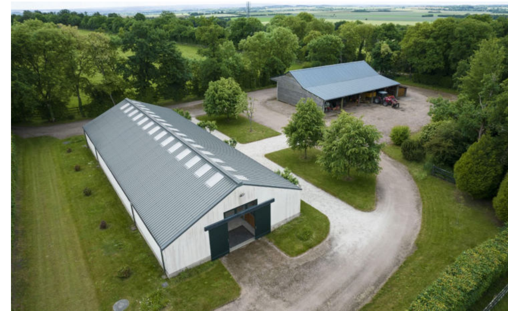
— La Haute Côte : 14 stall barn and hangar.