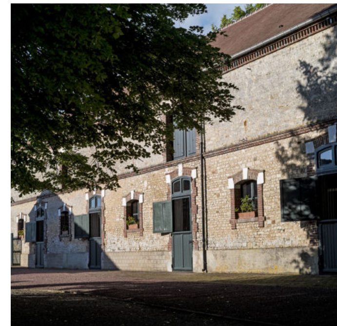
— La Grande Cour : 24 boxes, foaling unit.