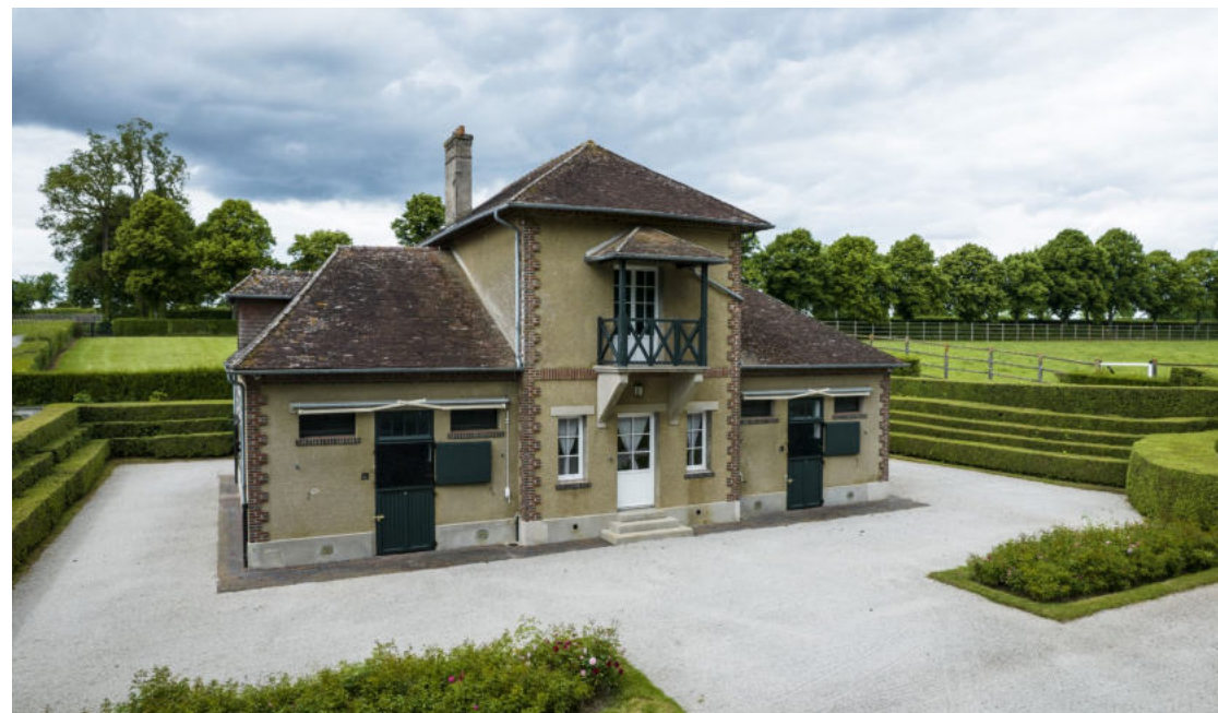
— Stallions yard : 4 boxes.